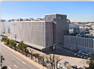
Exterior of Boeing Satellite Factory

Boeing's satellite systems business is located in El Segundo, Calif. The world's first geosynchronous communications satellite, Syncom, was built there by Boeing and launched in 1963. Since then, Boeing has delivered more than 300 satellites to more than 50 customers in more than 20 countries, and continues to design and build government and commercial satellites in its factory in El Segundo.