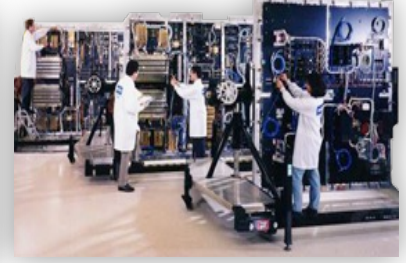
Payload Integration & Test