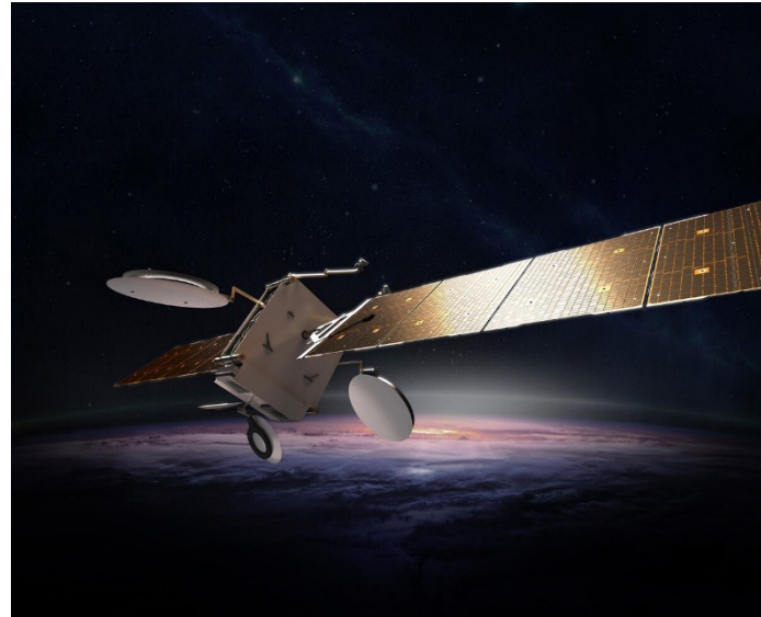
Artist rendering of Boeing's 702X satellite

The 702X incorporates proven design and technology from programs such as SES Networks' O3b mPOWER satellite, which is the medium Earth orbit variant of the 702X. The payload is flexible, configurable and has the lowest cost-per-bit offering in its market class. Applicable to any orbit, the 702X will change how operators use satellite communications to deliver value to end-users. With thousands of beams that are formed in real time and can be pointed and shaped where needed, 702X allows operators the flexibility to point power and bandwidth among users, maximizing useable capacity and eliminating wasted energy.