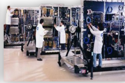
Payload Integration & Test